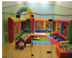
Mini Mayhem Area

We offer after school options on some of our parties too. For details and to book please call: 01279 621502